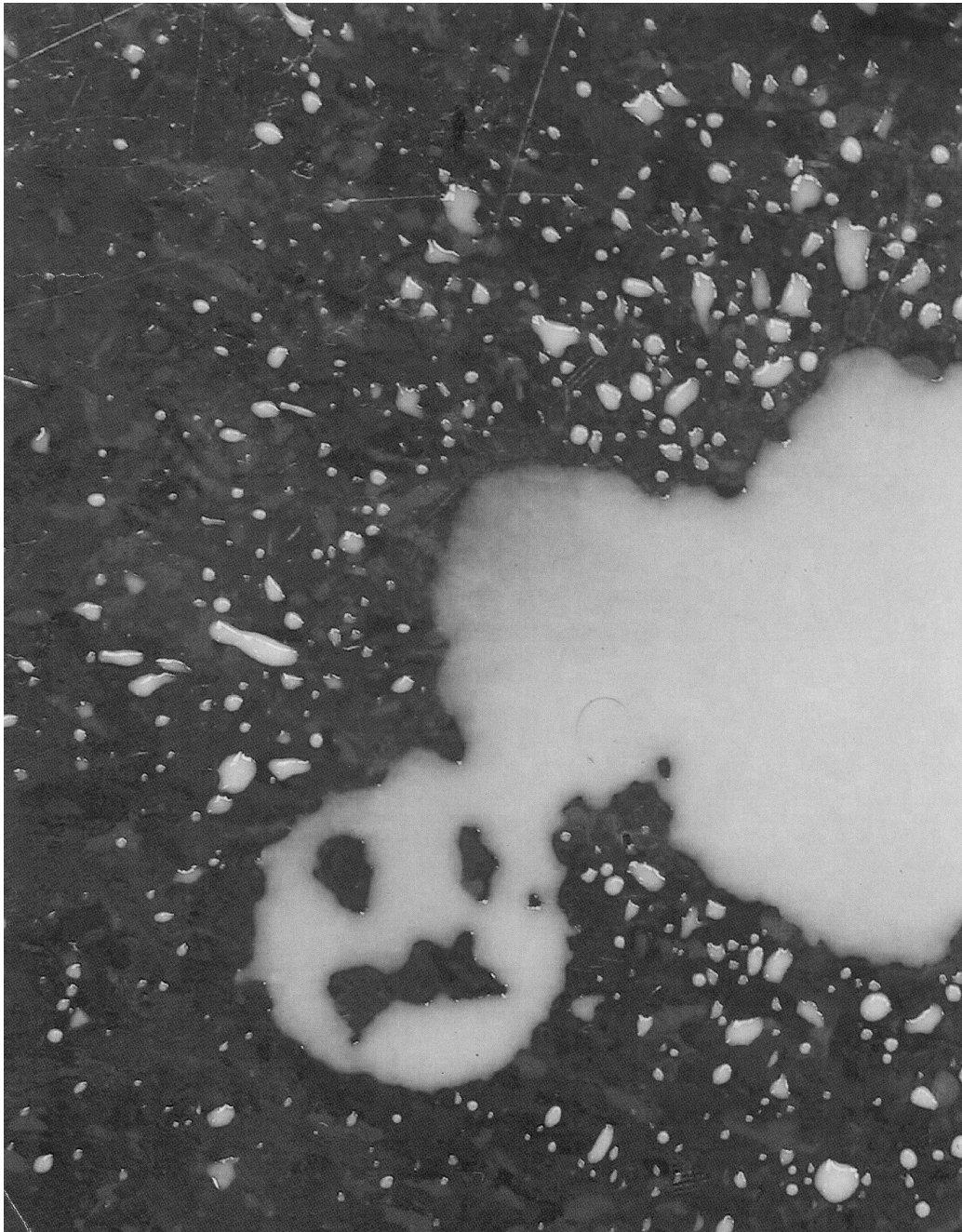
Fig. 1. A propofol poltergeist?

Support was provided solely from institutional and/or departmental sources.