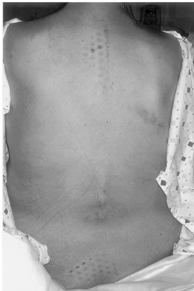
Fig. 1. Photograph showing skin injury at the mid-sacrum and mid-upper thorax.

The Food and Drug Administration-approved Allon System employs the ThermoWrap blanket, body temperature sensors, and a microprocessor that controls the heating unit. The ThermoWrap garment can be wrapped around the extremities and torso, thus allowing for a