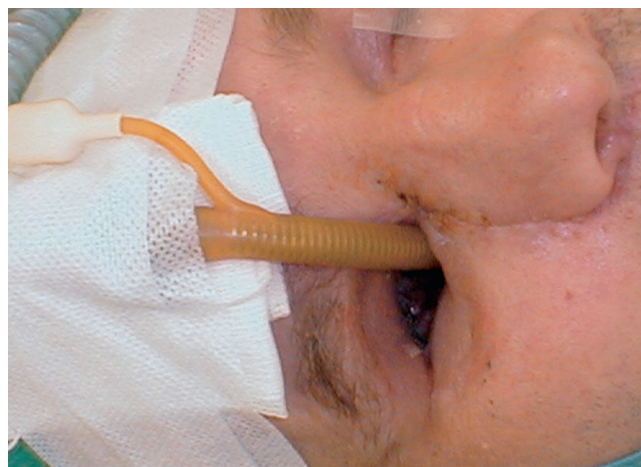
Fig. 1. The endotracheal tube was placed fiberoptically through the right orbit, which was communicating with the larynx.

In conclusion, the technique we describe for the first time offers safe and elegant airway management for patients with a frozen temporomandibular joint and airway alterations, including a communication