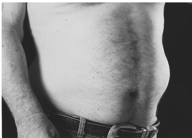
Fig. 1. (A) Frontal view of the patient at the time of presentation. Note abdominal wall asymmetry. (B) Side view of the patient at the time of presentation.

A presumed diagnosis of zoster sine herpete (shingles without cutaneous eruption) with thoracic motor involvement was made. The patient's soft tissue mass actually represented an area of thoracic intercostal and abdominal musculature with motor paralysis secondary to VZV. Treatment with a series of thoracic epidural steroid injections, gabapentin, and nortriptyline resulted in a significant resolution of his pain.