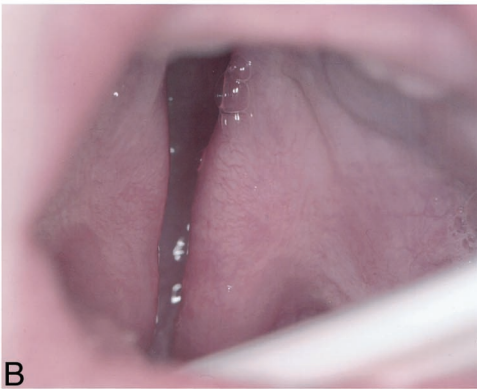
Fig. 1. (A) Nine-month-old infant with Smith-Lemli-Optiz syndrome presenting features associated with Pierre Robin sequence, including micrognathia, cleft palate (B), and pseudomacroglossia.