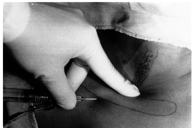
Fig. 1. The introducer needle is held in situ after puncture of the subclavian vein. The ipsilateral internal jugular vein (lying beneath the shaded area) is compressed externally in the supraclavicular area with the index finger of the left hand during the introduction of the "J-tip" guidewire with the right hand.

The characteristics of the patients in both groups were comparable (table-1). Ninety-eight patients in the control group and 97 patients in the study group had successful cannulation of the subclavian vein with the introducer needle. In the control group there were seven (7.14%) misplaced catheters detected with chest x-ray; six (6.12%) patients had misplacement of catheter into the ipsilateral IJV, and one (1.02%) into the contralateral subclavian vein. In the study group there were two (2.06%) misplaced catheters and both were in the contralateral subclavian vein. Difficulty was experienced during guidewire insertion with 4 patients of the control group and with 9 patients of the study group. Two patients in each group had mild pneumothoracies, which appeared on the chest x-ray. None of the study group patients complained of any untoward effects. Three patients in the control group complained of pain in the right ear and one patient experienced trickling sensations in the throat during the placement of the guidewire. No difficulties were encountered during the insertion of the