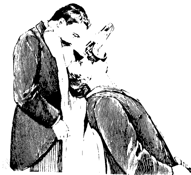
Fig. 2. Line engraving of Kirstein performing laryngoscopy. Reprinted with permission. 2

Kirstein was therefore almost certainly the first to describe what subsequently became called the "sniffing the morning air" position.