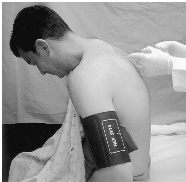
Fig. 2. Lateral view of unencumbered field.

(Accepted for publication June 16, 2000.)