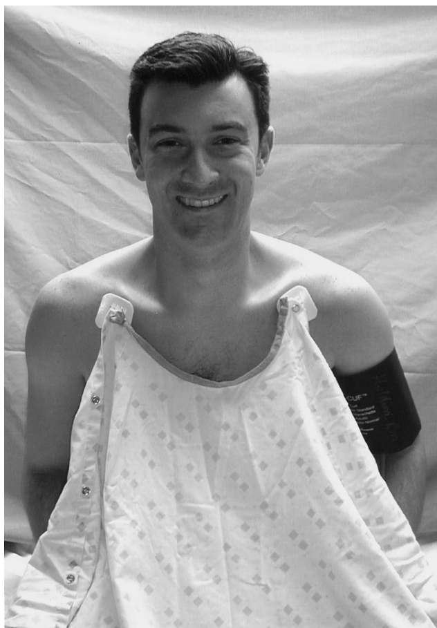
Fig. 1. Frontal view of electrocardiographic contact placement.

Support was provided solely from institutional and/or departmental sources.