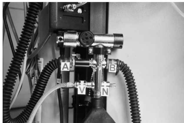
Fig. 1. Photograph of the scavenger interface for suction systems of the Narkomed 2B anesthesia machine with screw type adjustable needle valve (ANV). The 5/8 inches hexagonal lock nut has been removed to demonstrate the screw type ANV. A = hose A, the 19-mm hose connecting the ventilator relief valve to the scavenger interface; B = hose B, the 19-mm hose connecting the breathing system adjustable pressure limiting valve to the 19-mm terminal on the scavenger interface; N = the 22-mm terminal on scavenger interface for the ANV; V = the vacuum hose attached to vacuum source terminal.