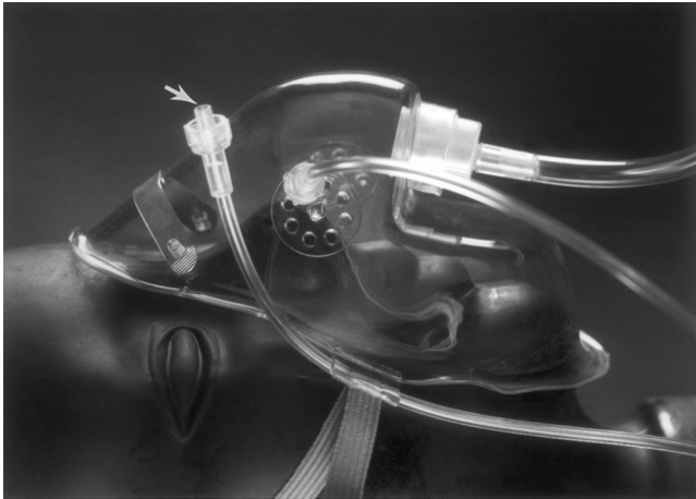
Fig. 1. The gas analysis line is shown in place on the Hudson mask on the mannequin. The 4-mm "male" protrusion is also shown (arrow) on separate tubing.

cently, the Intertech Gas sampling lines (order No. 225-3421-800; Smith Industries Medical Systems, Fort Meyers, FL) have become standard in our operating rooms (fig. 1). These lines have Luer-lock hubs with an internal 4-mm long and 4-mm diameter "male" protrusion. The hub can be twisted into and quickly secured within a vent hole of standard Hudson-style (Hudson Respiratory Care, Temecula, CA) oxygen masks when counterpressure is applied from inside the mask. In this way, the additional costs are eliminated to