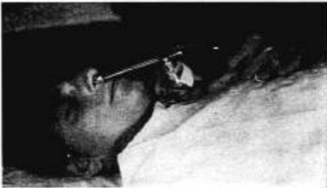
FIG. 1. Spraying cocaine solution through nose prior to intubation.

Ten minutes before scheduled operating time, with the patient on a carriage in the anteroom, a 4 per cent solution of cocaine is sprayed into each nostril, using an ordinary atomizer (fig. 1). The patient is instructed not to swallow but to allow the solution to remain "in the back of the throat" and then to expectorate into a gauze pad. The process is repeated in five minutes, the entire amount of cocaine used being less than 5 cc. It is remarkable that such cursory preparation provides entirely adequate topical anesthesia for intubation in the conscious patient. Spraying the nasal mucosa simplifies intubation by