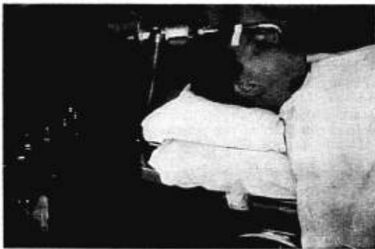
FIG. 4. Anesthesia equipment for fracture of mandible in use.

and bag are fixed to the operating table and held in proper position behind the patient's head. The anesthetist's position is displaced slightly, but he has free access to the patient. This entire arrangement of the anesthesia equipment is flush with the patient's face (fig. 4), cannot be compressed and permits movement of the patient's head with little danger of twisting or disconnecting any part of the airway.