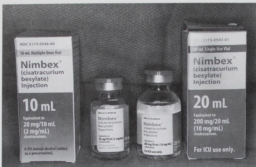
Fig. 1. Cisatracurium OR solution and ICU solution.