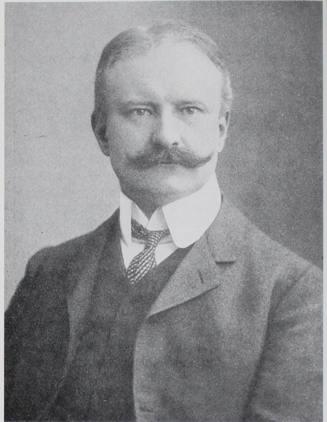
Fig. 3. Prof. August Bier (1861–1949). Portrait taken 1906.

Spinal anesthesia has had its ups and downs regarding clinical use during our century. Nevertheless, spinal anesthesia has nowadays gained worldwide popularity, and in the art and craft and complexity of modern anesthesiology, it is still one of the basic skills. Spinal anes-