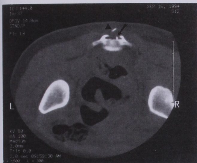
Fig. 1. Computed tomography scan of sacral region. Arrow: catheter in epidural space; arrowhead = subcutaneous catheter fragment.

two separate retained fragments and both were retrieved (fig. 2). Photomicrographs of the catheter showed fragmented ends that were consistent with twisting or crimping before breakage (fig. 3).