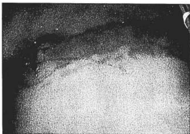
FIG. 1. Second-degree burn to the upper back following contact with bag of warmed intravenous fluid.

(Accepted for publication February 21, 1992.)