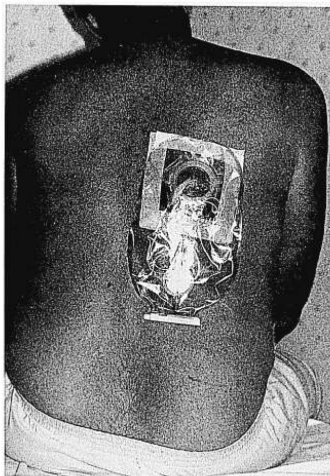
FIG. 2. Ostomy bag secured to baseplate with catheter protected inside.