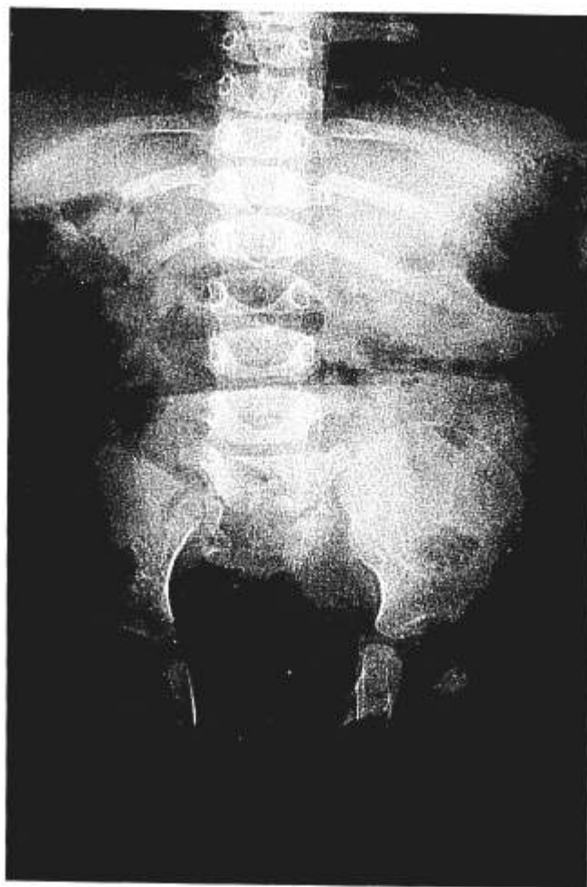
FIG. 1. X-ray of case 1, showing sacral agenesis with sacralization of fifth lumbar vertebra.

vertebral levels loss of resistance occurred with normal saline, but cerebrospinal fluid was obtained on attempted passage of the catheter, and the procedure was abandoned. At 36 h postoperatively, there was difficulty extubating the trachea because of extreme pain, which required 0.1\text{--}0.2\text{ mg}\cdot\text{kg}^{-1}\cdot\text{h}^{-1} morphine and 0.1\text{ mg}\cdot\text{kg}^{-1}\cdot\text{h}^{-1} midazolam and 1\text{ }\mu\text{g/kg} fentanyl as required. Repeat epidural catheter placement was performed successfully at L2–L3 using a 19-G needle with 21-G catheter. An infusion of 0.1% bupivacaine with 2\text{ }\mu\text{g/ml} fentanyl was commenced at 3.9\text{ ml/h} . Satisfactory analgesia was provided by 5.0\text{ ml/h} ; no further opioid or sedation was necessary; and the trachea was successfully extubated. The epidural infusion was continued for 96 h.