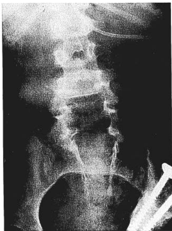
FIG. 3. X-ray of case 4 showing L4-L5 myelodysplasia.

colonic anastomosis, and bladder neck reconstruction under general anesthesia. Postoperatively he developed a right femoral nerve causalgia that was believed to be secondary to prolonged traction or compression intraoperatively. This pain persisted and was relieved only partially by a femoral nerve block 2 months later. Other pain in the right leg was believed to be sympathetically mediated and could be abolished by subarachnoid injection of lidocaine. He was readmitted for lumbar epidural and lumbar sympathetic blockade to treat his reflex sympathetic dystrophy. A 20-G epidural catheter was passed easily via a 17-G Tuohy needle at the L2-L3 interspace and was threaded 3 cm into the epidural space. Bupivacaine 0.125% was infused at 13 ml/h and abolished the pain. The epidural infusion was continued for 115 h.