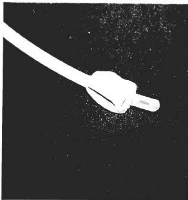
FIG. 1. Laser Shield™ laser-resistant endotracheal tube with new silicone atraumatic tip.

(Accepted for publication January 4, 1985.)