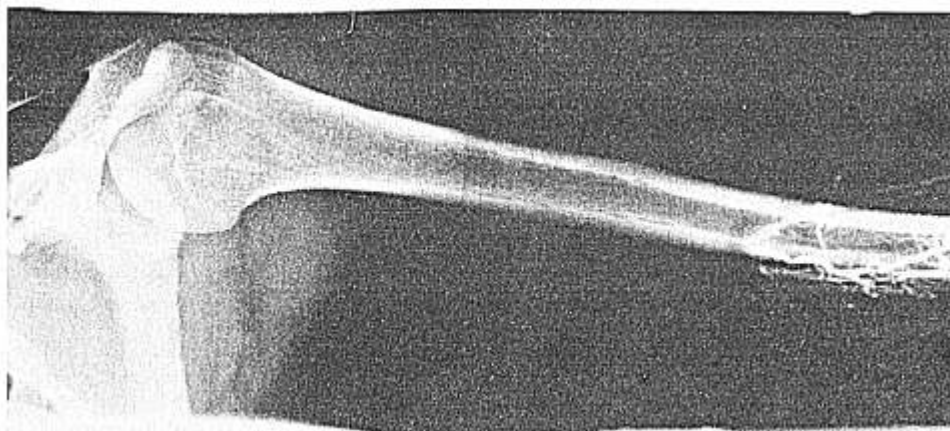
FIG. 2. Phlebography of the upper extremity of a patient (number 3) who in an earlier IVRA had bupivacaine in the circulation when the tourniquet was inflated. During the 5-min observation there was no contrast medium passing under the cuff.

Although the arterial blood pressure tended to rise during the ischemia in almost all the study subjects, the cuff pressure remained at least 80 mmHg above the systolic arterial blood pressure in each case.