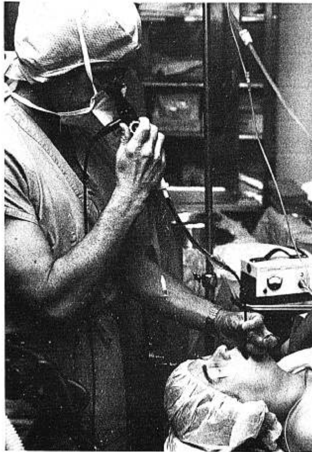
FIG. 2. Fiberoptic intubation with retractor.

mandibular joint, degenerative arthritis, patients in "halo" traction, fragile dental problems, normal patients whose tracheas are anatomically difficult to intubate with conventional laryngoscopes, and routine endotracheal intubations. With this retractor, unassisted fiberoptic endotracheal intubation in anesthetized patients proved to be a reliable rapid technique.