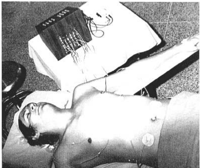
FIG. 2. The unit in place on a patient.