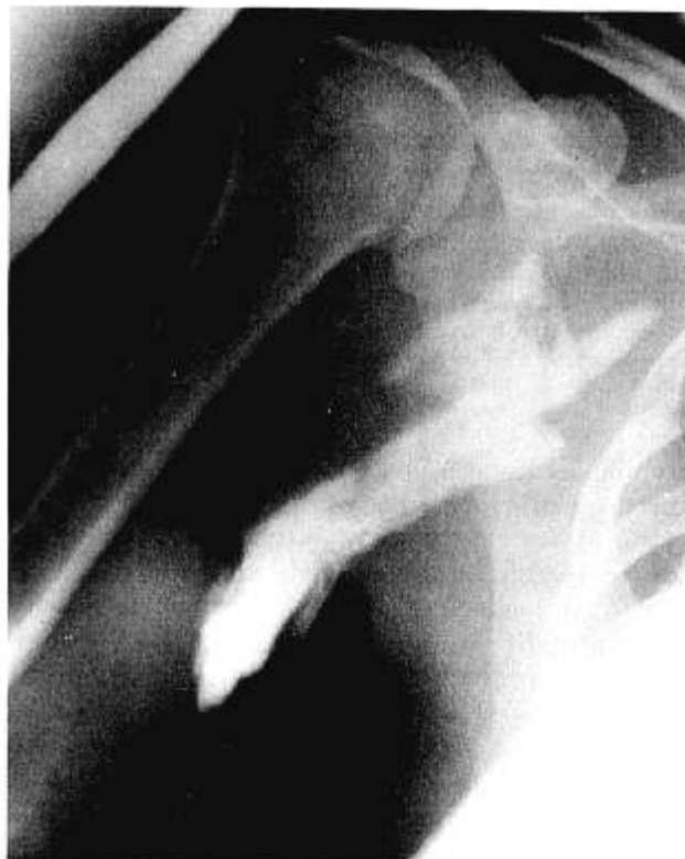
FIG. 1. Roentgenogram demonstrating the placement of the catheter within the axillary sheath following the injection of 10 ml Renografin 60®.

In the recovery room, the catheter position was confirmed radiographically (fig. 1) by injecting 10 ml Renografin 60®. Infusion of bupivacaine, 0.25 per cent, 10 ml/hr, was begun while residual analgesia was still present. A volumetric infusion pump was used to maintain a constant flow rate of bupivacaine. Regional analgesia of the hand was continued for the next two days, during which the patient did not need supplemental narcotics. No complication occurred postoperatively: vital signs remained normal,