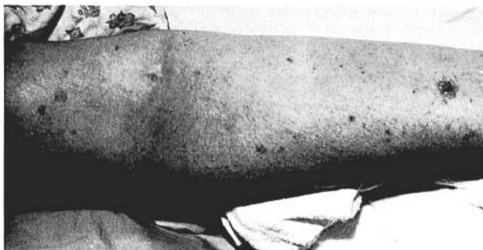
FIG. 2. Arm, showing pigmented keratoses and granulomatous formation at sites of earlier venipunctures.

had developed, probably due to section of the right recurrent laryngeal nerve. The patient's convalescence was otherwise satisfactory. At a later date, a Teflon preparation was injected into the paralyzed right vocal cord, with some improvement in speech. The patient remained in good general health to the time of the present admission.