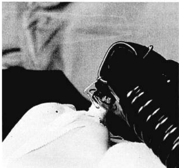
FIG. 2. Y-piece safety clip in use.

In addition to the stated advantage of preventing disconnections, the possibility of some adverse effects from these devices has been considered. The most serious potential problem is inadvertent removal of endotracheal tubes. Damage to equipment, injury to patients, and failure of these safety clips to perform their stated function are possible hazards.