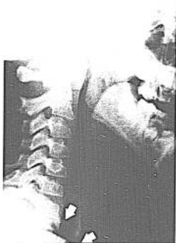
FIG. 2. Lateral roentgenogram of the neck, showing herniation of cupola of the right lung above the clavicle during a Valsalva maneuver.

Herniation of the lung has been reported only rarely. Fewer than three hundred cases have been described. The original classification of pulmonary hernias was made by Morel-Lavellee 1 in 1847. He classified the hernias by location, cervical, thoracic, and diaphragmatic, and by etiology, congenital or acquired. Acquired hernias were further subdivided into traumatic, consecutive (those following some