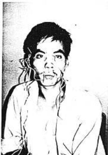
FIG. 5. A patient receiving therapeutic acupuncture with multiple needles for a neurologic disorder in the Shen-yang Hospital of Traditional Chinese Medicine.

I was most impressed by the great skill and dexterity with which our Chinese colleagues performed these procedures. It was obvious that they had been taught well, learned quickly, and gained extensive experience. The latter undoubtedly reflects the importance attached to regional anesthesia