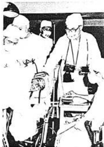
FIG. 2. The author observing and monitoring a patient undergoing lobectomy in the Kwang Chow Provincial Hospital.

As part of the national policy for self-reliance, virtually all of the medical equipment is manufactured in The People's Republic of China. In most of the larger hospitals the anesthetic equipment is good, and all drugs currently used in the United States are available, including all of the inhalation