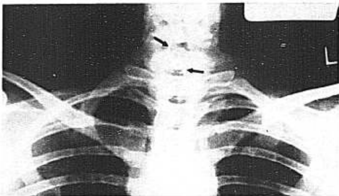
FIG. 2. Tracheal soiling, as evidenced by two thin lines of contrast medium on the tracheal wall, following sedation with diazepam.

bronchial tree. With 1 mg/kg, two thirds of the patients without preanesthetic medication had no evidence of aspiration, while in only one had the medium passed the carina. The addition of any sedative preanesthetic medication increased the risk of tracheal aspiration to a significant degree ( P < 0.025 , \chi^2 = 6.44 at 2 mg/kg; P < 0.01 , \chi^2 = 7.87 at 1 mg/kg).