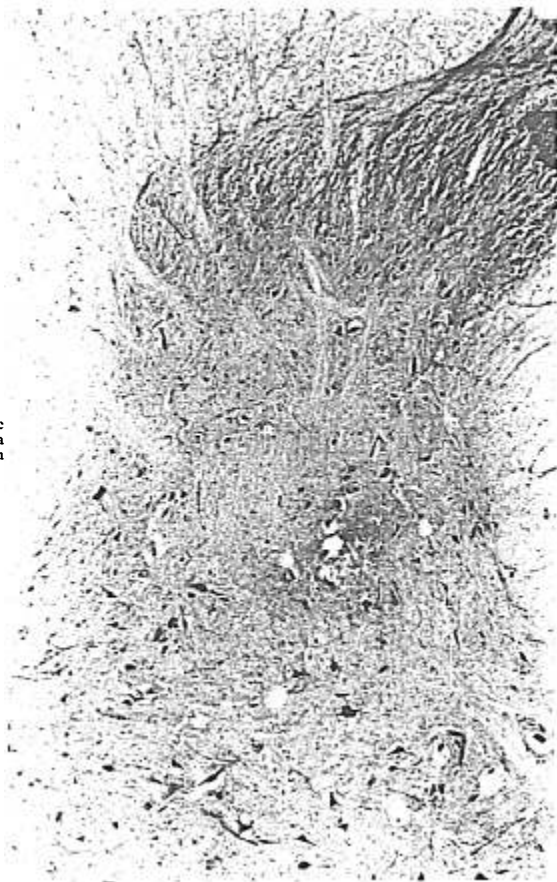
FIG. 3. An electrolytic lesion made through a recording electrode in lamina 5.

the analysis. This occurred only rarely, however.