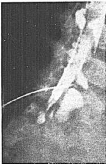
FIG. 1. Myelogram of a four and one-half year old child, showing contrast material in both the subarachnoid and the extradural spaces. Faulty placement of the needle, with the bevel partially in each space, was probably responsible.

anesthesiologist may be able to detect the characteristic sound of air in the heart by auscultation of the chest before a fatal quantity is administered. Air from peripheral veins enters the right side of the heart and the ventricle fills with froth, which prevents proper filling and emptying. Bubbles enter the pulmonary artery and may pass to the systemic side of the circulatory system. Air may also pass directly to the left side of the heart through a septal defect.