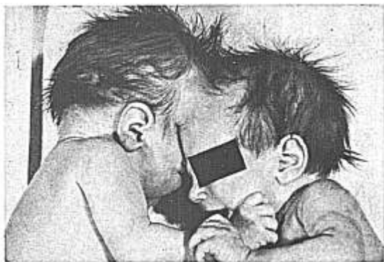
FIG. 1. Twin girls joined brow-to-brow. Separation was achieved in a 2-stage operation.

The operation consisted of separating two healthy, twin, three-month-old girls joined at the head (craniopagus), brow to brow. Although there was nothing unique in the anesthesia or procedure of surgical separation, careful attention to details was important.