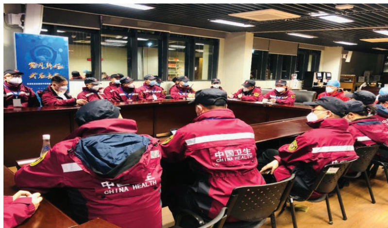
Fig. 1. A multidisciplinary meeting to discuss the operation of Wuchang temporary COVID-19 specialty Ark Hospital.

In creating these temporary hospital structures, we were guided by several design strategies, including the following.