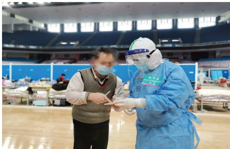
Fig. 4. A physician (J.X.) communicates with a COVID-19 patient inside Wuchang Ark Hospital.

patients with mild COVID-19 symptoms; patients with severe diseases are transferred to comprehensive hospitals.