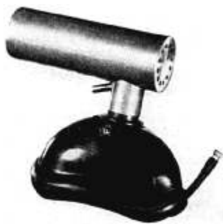
Fig. 1. Inhaler for administration of trichloroethylene vapor (side-view).

The inhaler shown is simple in design, construction and operation. It weighs about 16 ounces and can be held comfortably in the hand of the patient or administrator. On the end of the inhaler away from the mask are a number of notches and a depressed opening which leads into the body of the apparatus. When the inner metal tube is turned to the "Fill" position, as it can be by the key, a hemostat or a pair of scissors, the instrument is ready to be charged. Trichloroethylene, 15 cc., is poured into the hole and is absorbed by the material which lines the wall of the cylinder. After one minute the indicator on the end may be turned anywhere between "Min." and "Max.," and the instrument is ready for use. After it is filled it may be placed in any