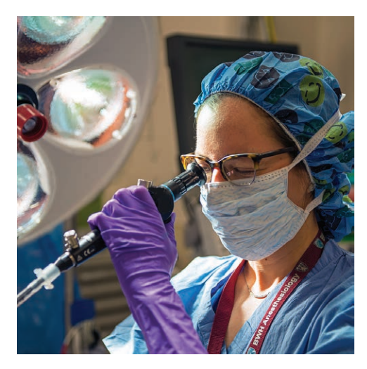
"...[W]e are making airway management safer. What remains to be studied is which advances in airway management have an impact on patient safety events."

The study has some important limitations that have been appropriately addressed by the authors. First, despite a concerted effort to validate the self-reported database against anesthesia records, it remains possible that reporting patterns changed during the study period because it is impossible to confirm that every difficult intubation was appropriately captured. The study design leaves open the possibility that