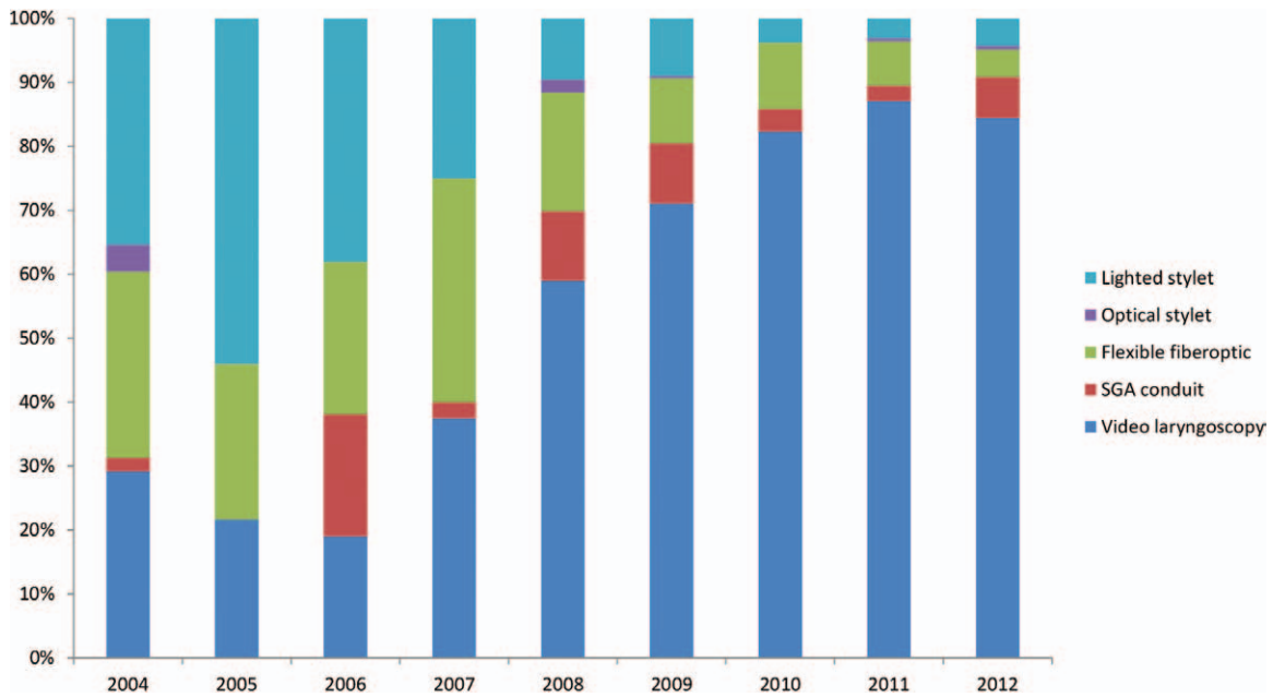
Fig. 2. Rescue techniques attempted over time. This diagram illustrates the proportional use of each studied rescue technique of interest over time. During this period, the use of video laryngoscopy has substantially grown, while the use of all other rescue techniques has proportionally decreased. SGA = supraglottic airway.

with airway management. Depending on the variable and contributing institution, 79% ( n = 1,122 ) of the 1,427 cases of failed direct laryngoscopy had preoperative airway examinations available for review. The final tally for data completion demonstrated that 54 to 63% of the 1,427 cases had valid preoperative airway examination details, depending on the variable. Based on the available data, 28% ( n = 313 of 1,122) of the cases where direct laryngoscopy failed had two or more predetermined predictors of difficult direct laryngoscopy recorded. An episode of hypoxemia as defined by SpO_2 of less than 90% for at least 1 min around the time of intubation was observed in 372 of 1,511 (25%) rescue attempts. A total of 782 of 1,511 (52%) cases were considered “higher risk” as defined by an episode of hypoxemia, or after difficult/impossible mask ventilation, or after two failed previous attempts at direct laryngoscopy.