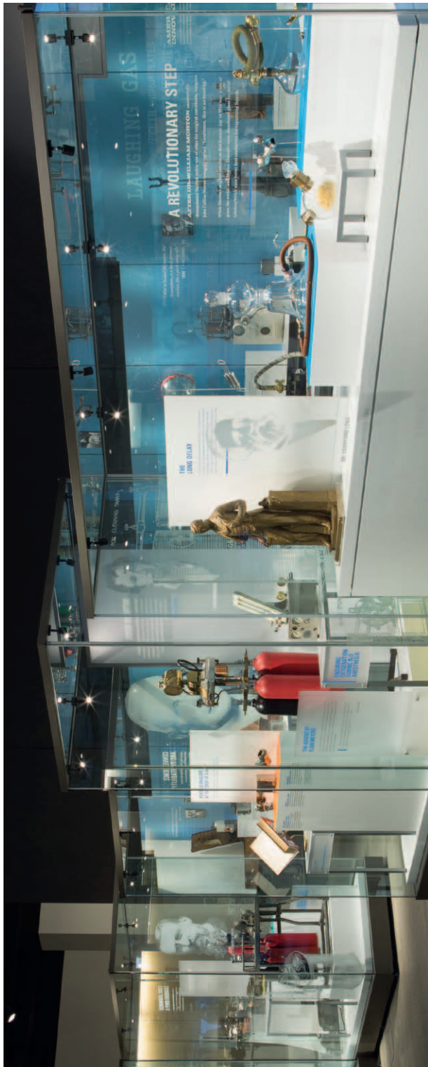
Fig. 2. The Wood Library-Museum's Legacy Hall Floor Cabinets. In the right foreground is the replica Morton Ether Inhaler. Flanking it are two glass inhalers, the bell-shaped 1846 Hooper and the conical 1847 Charrière, each of which was curatorially