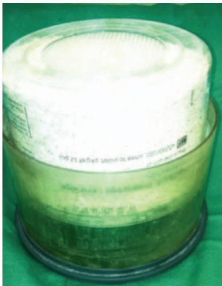
Fig. 2. Reanimated photo showing the initial point of friction that prevented extraction of the Medisorb® cartridge (GE Healthcare, Waukesha, WI), once inserted upside down into the canister.

6 min until the canister was replaced. We unfortunately did not observe the level of inspired carbon dioxide, oxygen, or anesthetic agent during this crisis, but this could be