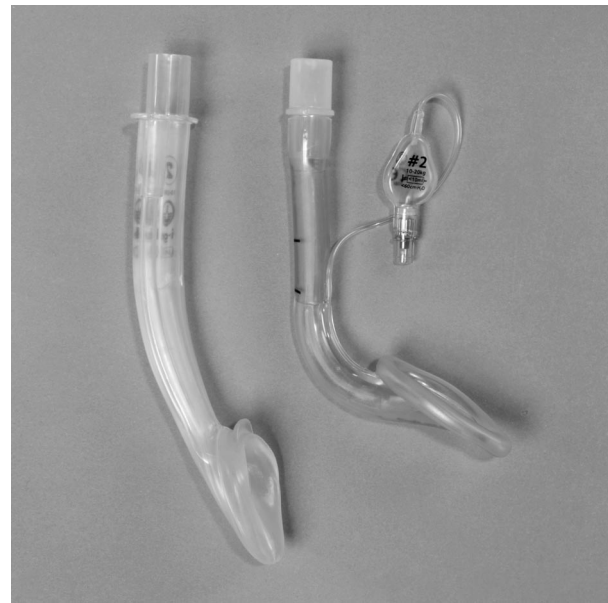
Fig. 2. Lateral view of the i-gel #2 (Intersurgical Ltd., Wokingham, Berkshire, United Kingdom) and the Ambu AuraOnce #2 (Ambu A/S, Ballerup, Denmark). The more pronounced airway angle of the Ambu AuraOnce compared with the i-gel is clearly visible.

The fiber-optic view was remarkably good through both devices, and epiglottic downfolding was rarely observed. The