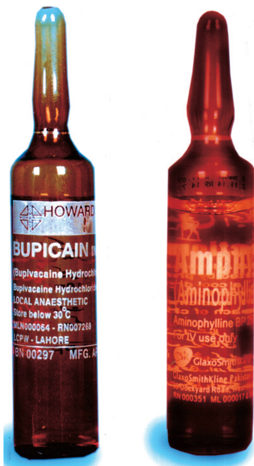
Fig. 1. Ten milliliter ampoules of bupivacaine (bupicain), 0.5%, versus aminophylline: similar size, shape, and color.

mg/dl). Lateral and oblique views of the lumbar myelogram showed mild external compression on the thecal sac at L3–L5, most likely the result of disc bulging at those levels. However, this type of radiographic finding is common in significant proportion within a healthy, asymptomatic population. Vertebral heights and disc spaces were likewise normal (fig. 2).