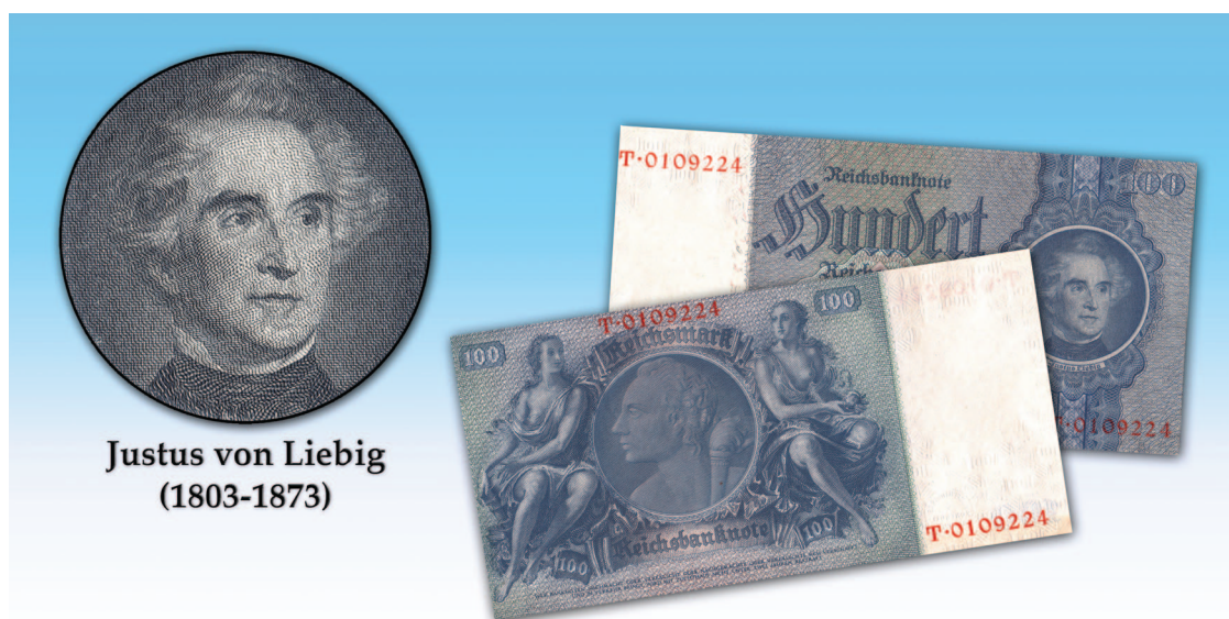
Justus von Liebig (1803-1873)

Naturalist Alexander von Humboldt steered Justus Liebig (1803–1873) from Gay-Lussac's private Parisian laboratory (1822–1824) to a chemistry professorship at Giessen in central Germany (1824–1852). There Liebig founded the world's first university-based research laboratory, unveiled chemical isomers, invented his "kali apparatus" (for combustion-based carbon analysis), theorized about chemical radicals, and edited the leading chemical journal. After pioneering nitrogen-based agricultural fertilizers in the late 1830s, Liebig published tomes on agricultural and physiological chemistry. As " Freiherr [Baron] von Liebig" by 1845 and "Munich Professor von Liebig" (1852–1873), he presided over the Bavarian Academy of Sciences and then mass produced nutritional meat extracts until his death. From 1935–1945, Liebig's portrait ( above left) graced the obverse of the 100 Reichsmark banknote. The academic forefather of nearly all of today's professors of organic chemistry, Liebig is hailed by anesthesiologists as the third man to independently discover chloroform. ( This image also appears in the Anesthesiology Reflections online collection available at www.anesthesiology.org.)