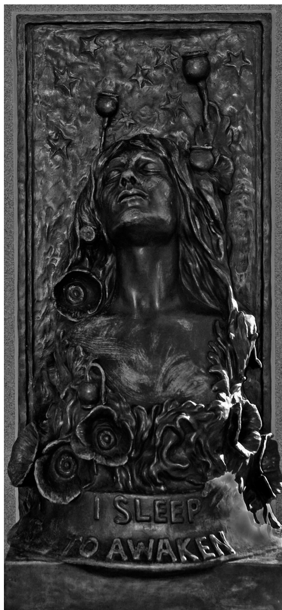
Fig. 5. "I sleep to awaken."

Louis Potter's original side reliefs were stolen in the 1980s and were later replaced with flat bronze facsimiles. However, in 2004, through the efforts of the Horace Wells Club of Connecticut, the Hartford Medical and Dental Societies, and Atena Foundation, and with an Assessment Award by the Save Outdoor Sculptures project, replicas of the originals were restored to their rightful position. Three of these contributing groups are located in the area where Wells practiced. As was a trend in the Ether Controversy, local pride and recognition became the focus point for many of the supporters to the claimants.