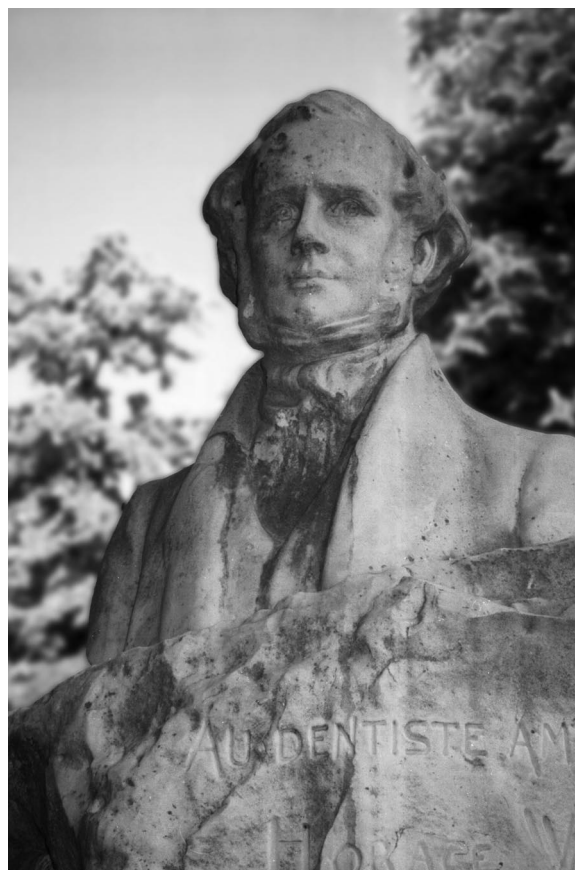
Fig. 7. Horace Wells' bust in Paris.