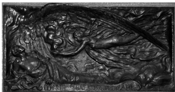
Fig. 4. Relief on Wells' tomb reading "THERE SHALL BE NO PAIN."

your unfailing love! Both high and low among men find refuge in the shadow of your wings" (Psalm 36). The large wings on Wells' grave might therefore be interpreted as God's protection. It can be assumed that the angel is bestowing the gift of anesthesia to humankind.