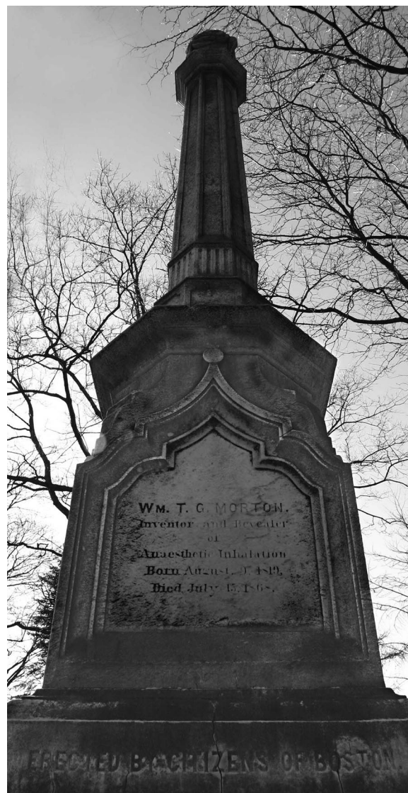
Fig. 1. Morton's tomb.

The monument atop Morton's grave consists of a four-sided base and a white granite pillar crowned with a