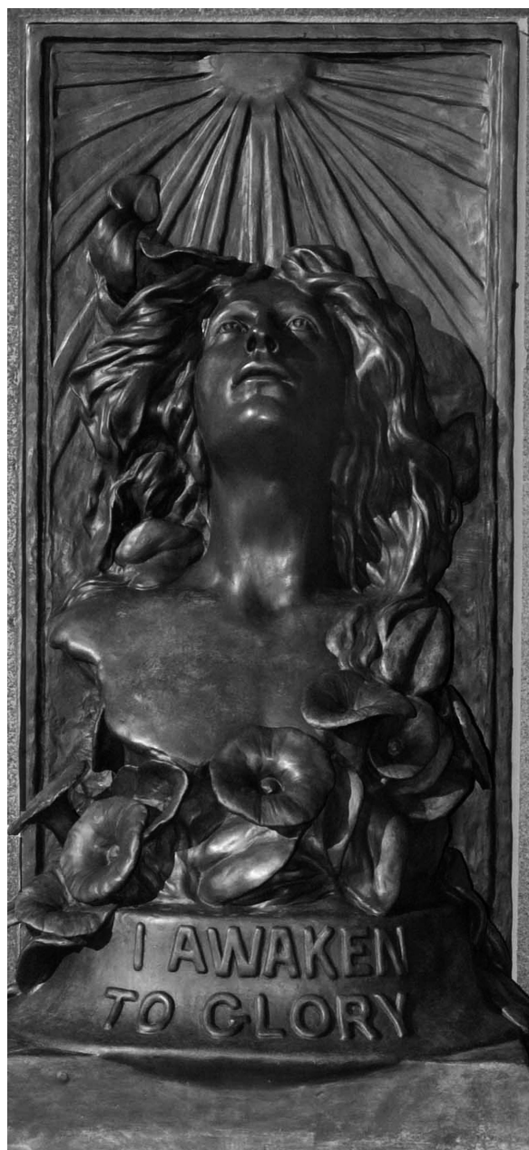
Fig. 6. "I awaken to glory."

ous characteristics of the statue: Wells looks to be pictured in mid-stance; he is wearing boots and holding a walking stick; he is also holding a box, book, and scroll. Likewise, the cloak that Wells is depicted to be wearing is wrapped around him and drawn close to his body. This was done to "suggest Wells' protection against the struggles of his life journey." 5 The walking stick also has an allegorical element. This can be seen as an extension of the arm and the self—an element of protection and security. 5 The walking stick or staff is also shown in the caduceus, a common symbol for the medicinal arts.