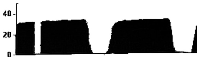
Fig. 4. Example of a normal-appearing capnogram after wrapping the water trap with a 3M Tegaderm dressing (3M Health Care, St. Paul, MN) and with a normal length sample tube.

waveforms have been described 5 and are the result of room air drawn into the sample line, often through a leak or loose connection anywhere between the elbow connector and gas analyzer. The leak allows room air to enter the sample line during expiration as the result of negative pressure produced by the sampling pump's suction. The entrainment of room air dilutes the expiratory carbon dioxide in the sample. With the onset of positive-pressure mechanical ventilation, the pressure gradient across the leak reverses; the leak is now outward, eliminating the dilution effect. The onset of inspiratory flow begins well before the gas sample arrives at the analyzer. This sample lag time is dependent on sample line dead space, sample flow rate, and ventilator pressures. The result is a late expiratory plateau prior to the normal down slope of the capnograph waveform. While we suspected a sample line leak in our originally observed capnogram, the occurrence of a midexpiratory hump was difficult to explain.