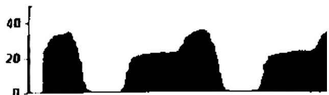
Fig. 2. An example of the capnogram after replacement of the original (modified) sample line (5.2-ml dead space) with a new standard length sample line (3.7-ml dead space). Note that the midcapnograph hump has moved to the right (shorter transit time) of the capnograph tracing.

The measurement of end-tidal carbon dioxide is a fundamental component of patient monitoring during anesthesia. Any abnormalities must be noted, investigated, and treated accordingly. To our knowledge and subsequent review of the literature, the observed abnormal capnograph waveform (fig. 1) was unlike any previously reported. The gas analyzer in the Dräger Apollo anesthesia machine aspirates 200 ml/min ( \pm 40 ml/min) of respired gases from the elbow connector at the Y piece through the sample line and water trap for the measurement of end-tidal gas partial pressures. Biphasic, dual-plateau