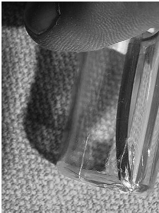
Fig. 3. Cracked water trap.

waveforms have been described 5 and are the result of room air drawn into the sample line, often through a leak or loose connection anywhere between the elbow connector and gas analyzer. The leak allows room air to enter the sample line during expiration as the result of negative pressure produced by the sampling pump's suction. The entrainment of room air dilutes the expiratory carbon dioxide in the sample. With the onset of positive-pressure mechanical ventilation, the pressure gradient across the leak reverses; the leak is now outward, eliminating the dilution effect. The onset of inspiratory flow begins well before the gas sample arrives at the analyzer. This sample lag time is dependent on sample line dead space, sample flow rate, and ventilator pressures. The result is a late expiratory plateau prior to the normal down slope of the capnograph waveform. While we suspected a sample line leak in our originally observed capnogram, the occurrence of a midexpiratory hump was difficult to explain.