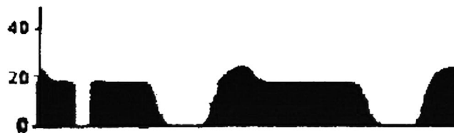
Fig. 5. An example of the capnogram after adding an additional 24 inches (additional 1.5 ml of dead space) of arterial tubing to the original (modified) sample line (6.7-ml total dead space). Note that the original midplateau hump has moved further to the left of the capnogram (longer transit time).

We hypothesized that this triphasic capnogram was a result of increased dyssynchrony between the positive-pressure phase of mechanical ventilation and the arrival of the end-tidal gas at the gas analyzer. During expiration, negative pressure at the crack in the water trap allowed room air to enter the sample, thereby decreasing the carbon dioxide concentration by sample dilution (first plateau). At the initiation of inspiration by the mechanical ventilator, the negative pressure at the cracked water trap is reversed as the piston exerts positive pressure (peak inspiratory pressure), represented by the higher plateau (hump). The higher plateau most accurately represents end-tidal carbon dioxide as sample dilution is eliminated. We hypothesize that the third plateau was due to the increased sample line volume. This increases the dead space and therefore the time between expiration and the arrival of end-tidal carbon dioxide at the analyzer. Assuming a 200 ml/min sample flow rate, a 1.5-ml increase in sample-line dead space could be expected to result in a 0.45-s increase in transit time. Thus, the positive-pressure phase of inspiration shifts to the left (longer transit time) in the capnograph waveform. At the end of the positive-pressure phase of mechanical ventilation, the expiratory carbon dioxide in the sample line is diluted again as a result of the leak in the water trap producing the lower plateau (third plateau).