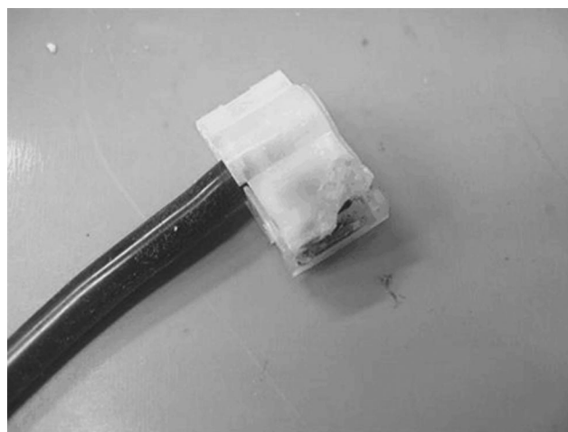
Fig. 3. The eroded cable connector that caused the malconduction trouble.

Support was provided solely from institutional and/or departmental sources.