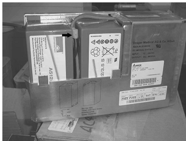
Fig. 2. A pair of the same type of batteries as the failed battery is placed in the adjunct battery assembly of the DC power module. The arrow indicates the cable connector to a battery.