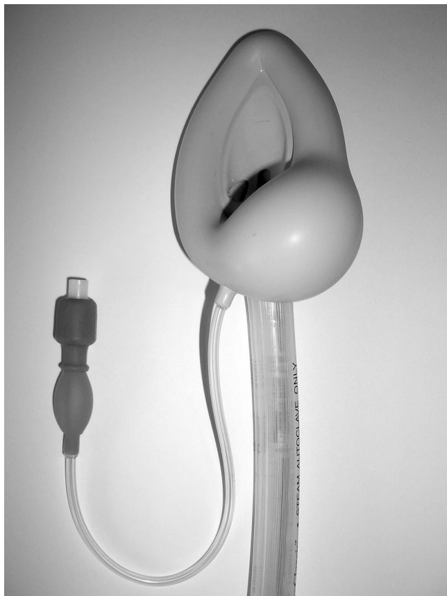
Fig. 1. Laryngeal mask airway with inflated cuff.

Removal of the LMA™ and inspection of the cuff should be considered to rule out this potentially deleterious technical problem.