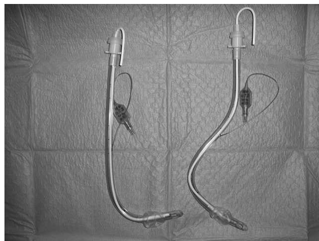
Fig. 1. The traditional “hockey stick” configuration (left) compared with the new way of shaping the tube (right). The difference between these two configurations is evident: Whereas the first tube is shaped according to two main axes, the second one takes advantage of three different axes.

Correct placement of the endotracheal tube is possible after only four simple phases. Under direct laryngoscopy, the tube is initially inserted into the patient's oral cavity with axis a parallel to his body surface (phase I). At the end of this phase, the distal part of the tube follows the tongue profile, and axis c coincides with the mouth axis. The tube is then rotated backward (in the sagittal plane) by 45°–60° (phase II). The tube now fits perfectly to the profile of tongue and laryngopharynx: In fact, axis c is now aligned with the pharynx axis, whereas axis b coincides with the mouth axis. Finally, there should be a combined movement of further backward rotation (10°–15°) and an advance of the endotracheal tube (phase III). This