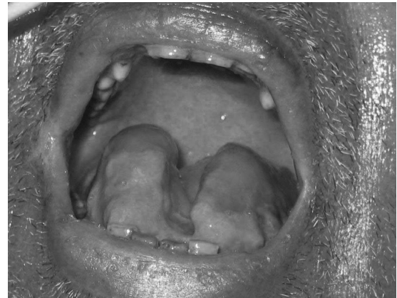
Fig. 1. Aspect of the tongue on postoperative day 10 showing superficial necrosis and medial clefting.

The pathophysiologic mechanisms of the injury include prolonged glossal compression with venous congestion, edema, and ischemia that lead to the tongue necrosis. 2 The main reason for the swelling seems to be a compression of the glossal blood vessels, especially the lingual veins. Other causes include sublingual hematoma 3 and obstruction of the submandibular duct. 4 The position of the patient may also contribute to this problem. Massive tongue edema after spinal surgery has been reported, attributed to the flexed thoracic–cervical position required. 5 Lingual nerve injury has been associated with orotracheal intubation and may contribute to this problem because of sensory deprivation. 6