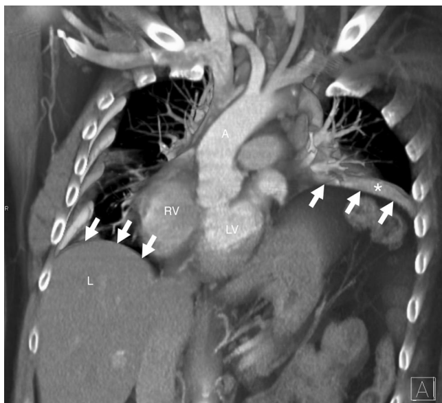
Fig. 2. Computerized, contrast-enhanced, multisliced tomography; coronary reconstruction. White arrows mark the right and left diaphragm; left side elevated diaphragmatic dome with compression atelectasis (*). A = aorta; L = liver; LV = left ventricle; RV = right ventricle.

MN) 8 months previously, he experienced intractable neuropathic pain, including deafferentation pain at the left upper limb, and tactile allodynia at the left chest after a coagulation of the dorsal root entry zone of the substantia gelatinosa (DREZ lesion) 1 yr ago. At time of presentation, the medication included 75 mg amitriptyline, 1,800 mg gabapentin, and an intrathecal infusion of 4 mg morphine per day since 1 yr. The pain relief was insufficient, with a mean pain level of 7 on a numeric rating scale (0–10). In addition, the patient reported increasing dyspnea, severe fatigue, sleep disorder, and depressed mood during the past 8 months. He was unable to walk more than 10 m, he needed permanent administration of oxygen, and partly assisted ventilation (continuous positive airway pressure) became necessary during the past 6 months. The medical and