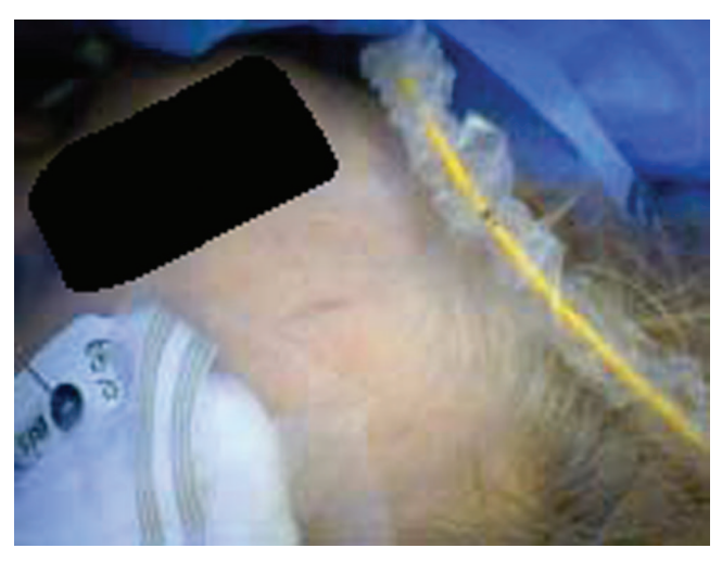
Fig. 2. The pressure groove on the patient's forehead.

Support was provided solely from institutional and/or departmental sources.