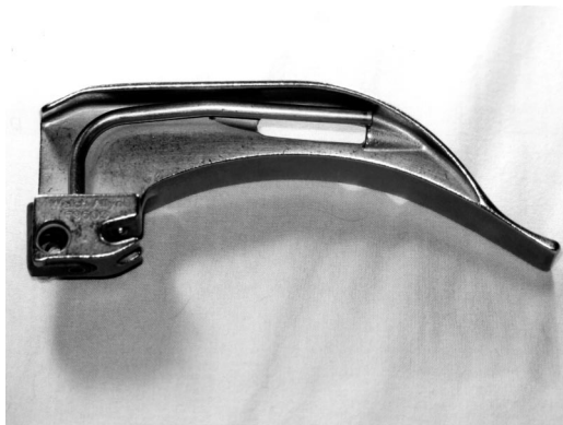
Fig. 1. Misassembled laryngoscopic blade.

Closer examination of the blade revealed a misassembled laryngoscope blade with the fiberoptic light source on the outside of the blade (fig. 1) instead of its correct position (fig. 2). Another laryngoscope was used at this point, and intubation was performed easily, revealing normal anatomy.