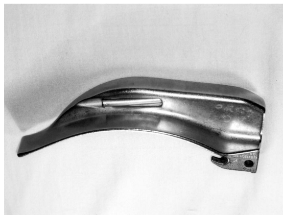
Fig. 2. Normal laryngoscopic blade.

The fiberoptic component of this type of laryngoscope blade is removable for cleaning or can spontaneously come loose. Care should be taken during its reassembly.