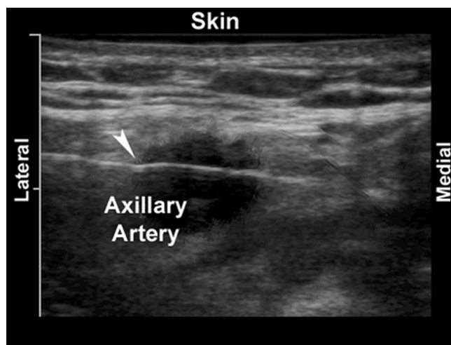
Fig. 1. “Bayonet” bending of the needle shaft echo as the block needle passes through soft tissue and the axillary artery during an ultrasound-guided axillary nerve block. The arrowhead indicates the part of the needle echo that bends toward the ultrasound probe on the skin surface. Tick marks are 10 mm apart.

ent depth of received echoes. The speeds of sound among soft tissues may actually range from 1,450 m/s in fat to more than 1,600 m/s in muscle. 10 Thus, clinical scanning can routinely produce speed of sound errors of approximately 5%.