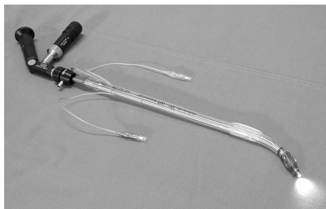
Fig. 1. Bonfils intubation fiberoptic scope mounted with a 39-French left-sided double-lumen tube (Bronchocath; Mallinckrodt Medical, Athlone, Ireland). The tube connectors have been shortened to the appropriate length. Light source is powered by a battery handle.

Few intubation tools are suitable for DLT placement. The fiberoptic bronchoscope, which has evolved as an accepted standard for management of the difficult airway, 4 may not be suitable for oral DLT insertion. The limited ID of the bronchial lumen of the DLT only allows use of a relatively small fiberoptic bronchoscope, and elastic oropharyngeal soft tissues, especially a large tongue, may prevent successful passage through the mouth. In conclusion, the Bonfils intubation fiberoptic scope may be used with DLTs of 37 French or greater after appropriate tube shortening in patients with a difficult airway anatomy.