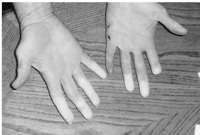
Fig. 1. Photograph of patient's hands preoperatively.

Subsequent to this surgery, she has decreased her oral analgesic medications and continues to be active.