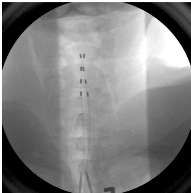
Fig. 2. Cervical spinal cord stimulator electrode placement.

Spinal cord stimulator settings from her most recent reprogramming session are available for review in the Appendix.