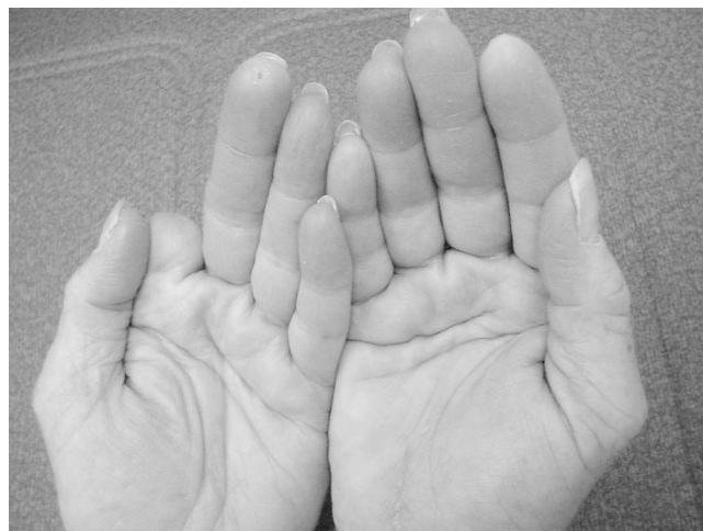
Fig. 3. Photograph of patient's hands 5 months postoperatively.